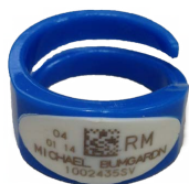
Saturn™ TLD Ring Easily sterilized and improved comfort and fit